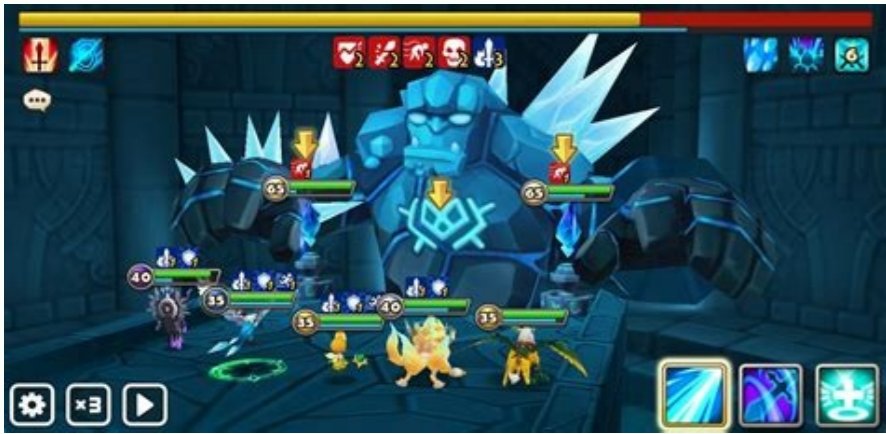
DB10 team summoners war. Db10 teams.